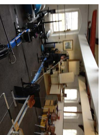
EXISTING EXERCISE AND SOCIAL AREA