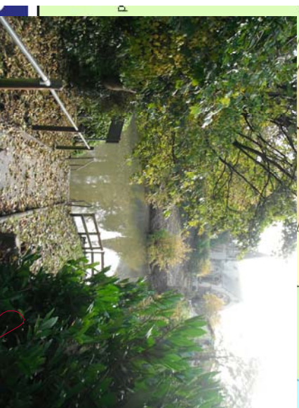
EXISTING ACCESS TO THE RIVER