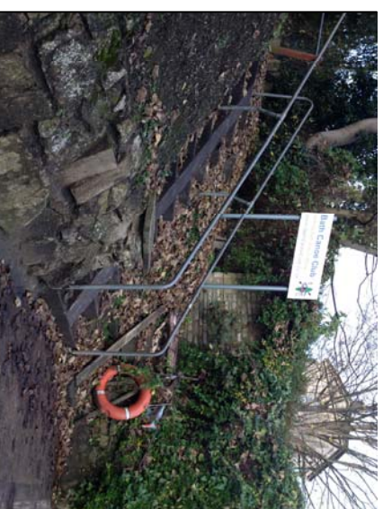
EXISTING ACCESS TO THE RIVER

Upstairs - increase floor space to allow greater use of the building. Open space will allow flexible use. Heated interior will attract members to use the facilities. Outside - Access to the water. All access is through one narrow steep corridor. Remodelling will remove the current hazard and reduce the risk of injury and damage.