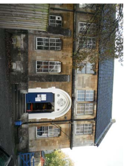
NORTH EAST FACADE OF THE CANOE CLUB