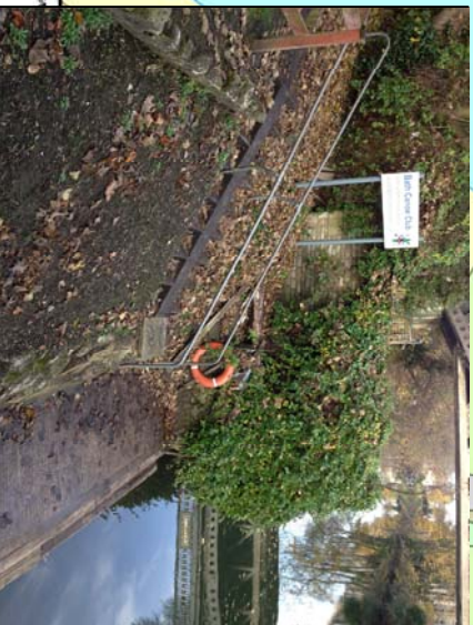
EXISTING ACCESS TO THE RIVER