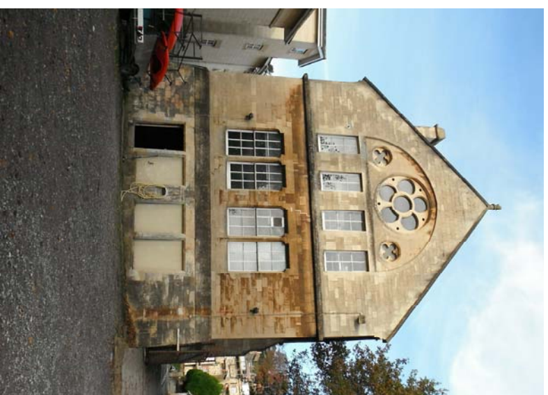
SOUTH EAST FACADE OF THE CANOE CLUB